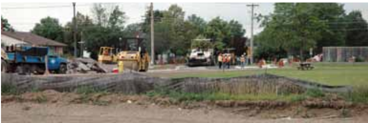
Victoria Meadows Subdivision Site Servicing – St. Catharines, ON

UEM's Engineering Team has a wealth of experience in the planning, design and implementation of municipal infrastructure projects. Our extensive knowledge of design principles, environmental regulations, zoning and servicing issues, and industry innovation is reflected in our comprehensive suite of services.