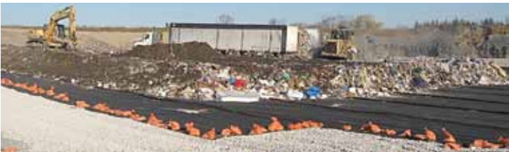
Construction inspection at Niagara Waste Systems South Landfill - Thorold, ON

UEM's Waste Management Team includes experts in master planning, site selection, approvals, facility design, operations and environmental management. We offer expertise and experience in every aspect of waste management, developing programs that address clients' needs for diversion, disposal and resource recovery.