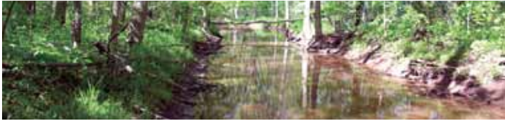
Beaver Creek Fluvial Geomorphological Assessment – Fort Erie, ON

UEM's Water Resources Specialists develop ecologically engineered solutions to repair, restore, protect and enhance aquatic and riparian habitats. Our Specialists employ innovative, natural and cost-effective techniques to address the impacts of flooding, erosion, and pollution. Services include planning, design, contract administration, site observation and post-construction monitoring.