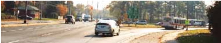
Sedona (Dixie) Traffic Review – Mississauga, ON

UEM's Traffic and Transportation Specialists have considerable experience in the planning, design and operation of safe, efficient and sustainable multi-modal transportation infrastructure. Our Traffic and Transportation Specialists recognize that a project's success extends beyond technical solutions alone. We work closely with UEM's Environmental, Municipal and Planning Specialists to deliver sustainable solutions.