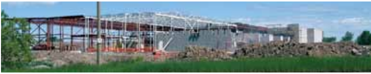
Project Administration for MacBain Community Centre – Niagara Falls, ON

UEM's program and project management services range from project delivery advice through consultant selection and plan review to project completion and implementation. We are responsible, we are accountable, and we deliver.